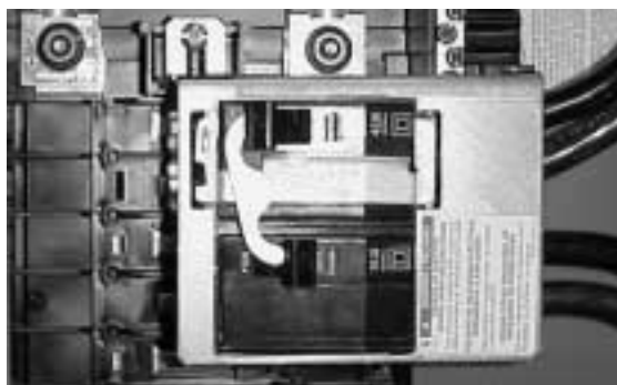
QO Manual Transfer Equipment Kit shown installed